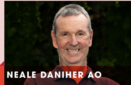
NEALE DANIHER AO